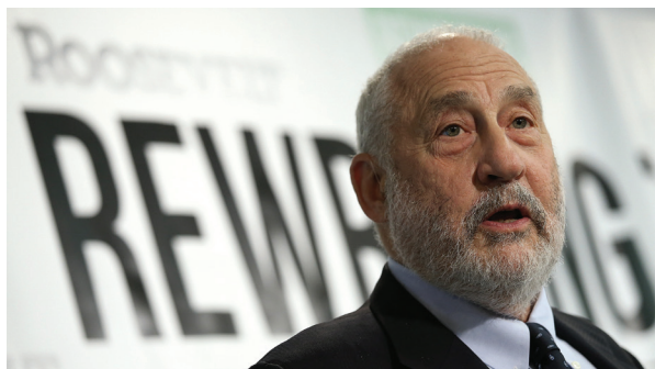
Roosevelt Institute Chief Economist Joseph Stiglitz speaks about the release of Rewriting the Rules on May 12, 2015, in Washington, DC.