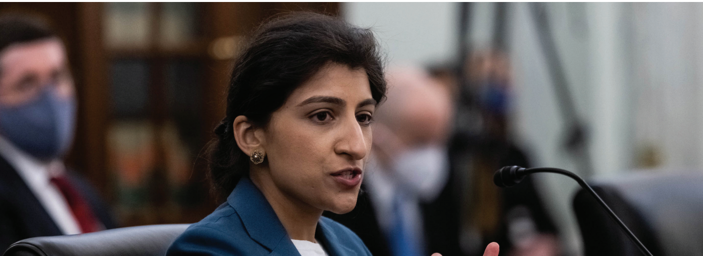
Then-FTC Commissioner nominee Lina Khan testifies during a Senate Commerce, Science, and Transportation Committee nomination hearing on April 21, 2021, in Washington, DC.