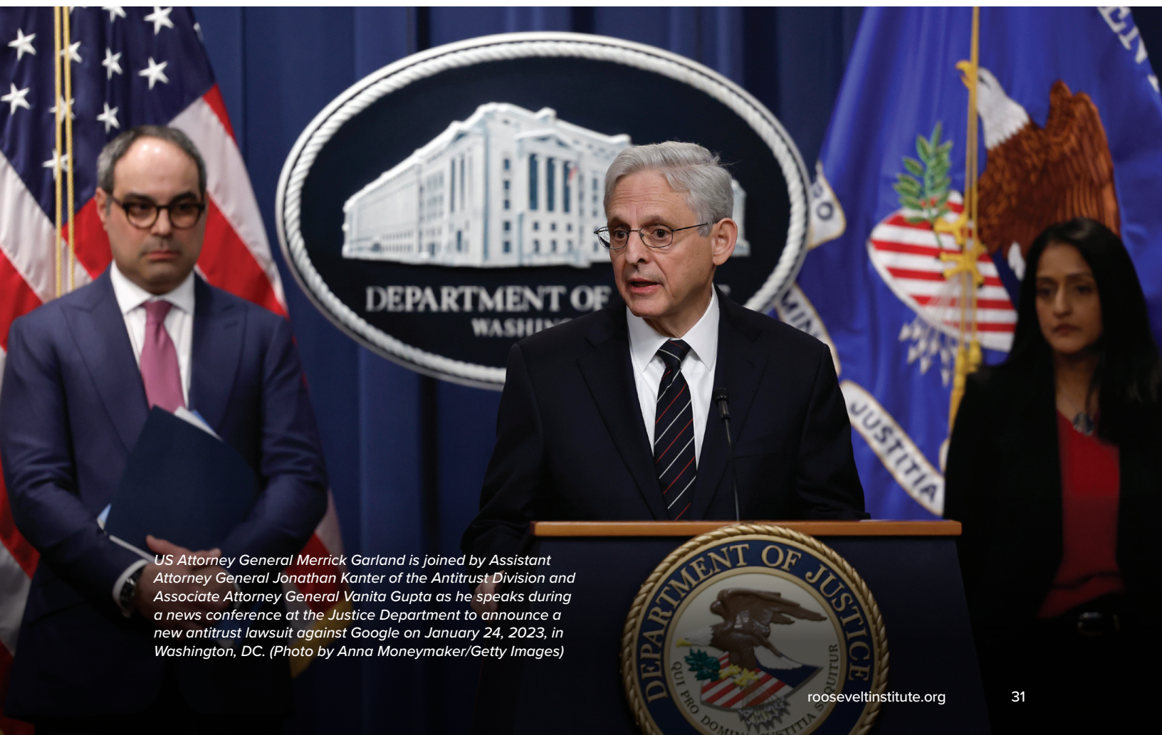
US Attorney General Merrick Garland is joined by Assistant Attorney General Jonathan Kanter of the Antitrust Division and Associate Attorney General Vanita Gupta as he speaks during a news conference at the Justice Department to announce a new antitrust lawsuit against Google on January 24, 2023, in Washington, DC.

In 2017, we saw a glimpse into the future of antitrust, when now-FTC Chair Lina Khan published her “Amazon’s Antitrust Paradox” paper. Arguing that Amazon’s pricing and vertical integration practices distorted markets and represented monopolistic control, Khan showed that the consumer welfare standard was poorly suited to checking market power in our current economy ( Khan 2017 ).