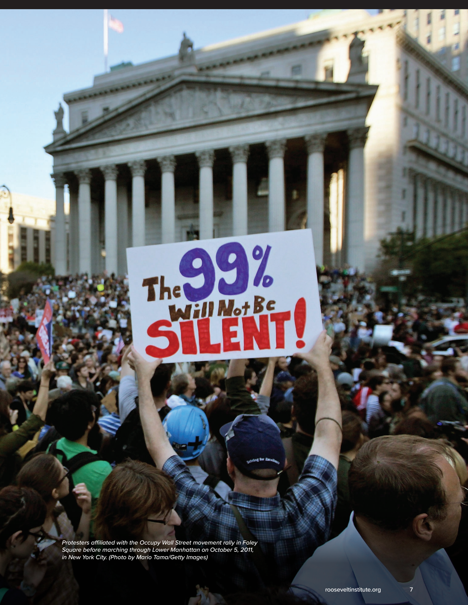
Protesters affiliated with the Occupy Wall Street movement rally in Foley Square before marching through Lower Manhattan on October 5, 2011, in New York City.