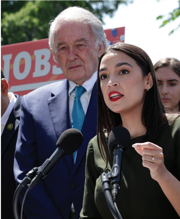
Rep. Alexandria Ocasio-Cortez (D-NY) and Sen. Ed Markey (D-MA) reintroduce their Green New Deal resolution at a news conference in Washington, DC, on April 20, 2023.