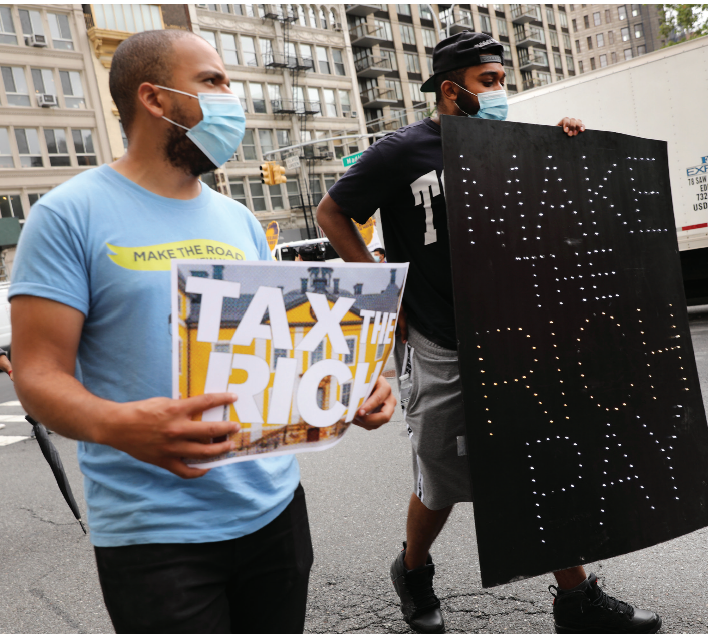
People participate in a “March on Billionaires” event on July 17, 2020, in New York City.

Questions about competition are fundamentally about whether or not new firms or other players can enter a sector, and whether the lack of competition leads to market power, wherein a firm can then raise prices, lower wages, and generally abuse its position because it exists in a pressure-free environment. But tackling outsized corporate power goes beyond just ensuring that markets are “free and fair.” Either government or other sources of countervailing power must also work to make sure that corporations—meaning corporate boards and management—don’t only prioritize financial gain for shareholders and executives in the name of “profit maximization,” and instead act on behalf of their workers, their own corporate future (by making long-term investment decisions), and, in an age of rapid climate change, the planet.