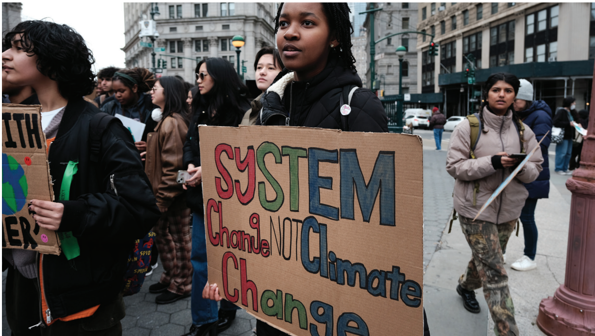
Dozens of local schoolchildren, activists, and others participate in a Strike for Climate march on March 3, 2023, in New York City.