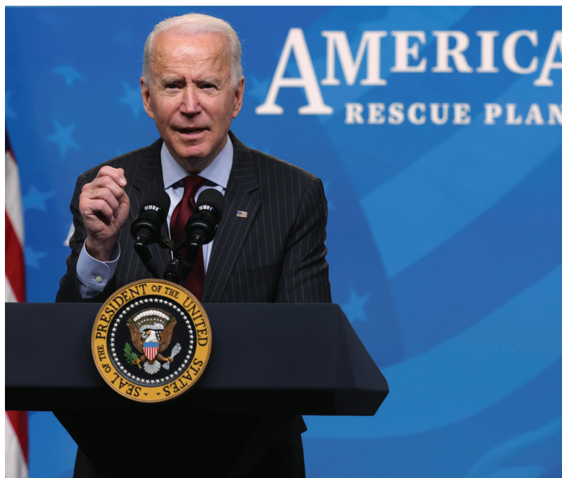
President Biden speaks during an announcement related to small businesses at the South Court Auditorium of the Eisenhower Executive Office Building on February 22, 2021, in Washington, DC.

Below, we look closely at how academics, policy analysts, and movement activists laid the groundwork for both the economic response to COVID and the cancellation of student debt over the previous decade. In both cases, we see the neoliberal and individualistic ideas of old giving way to experimentation with the post-neoliberal ideas of public provision and democratic participation.