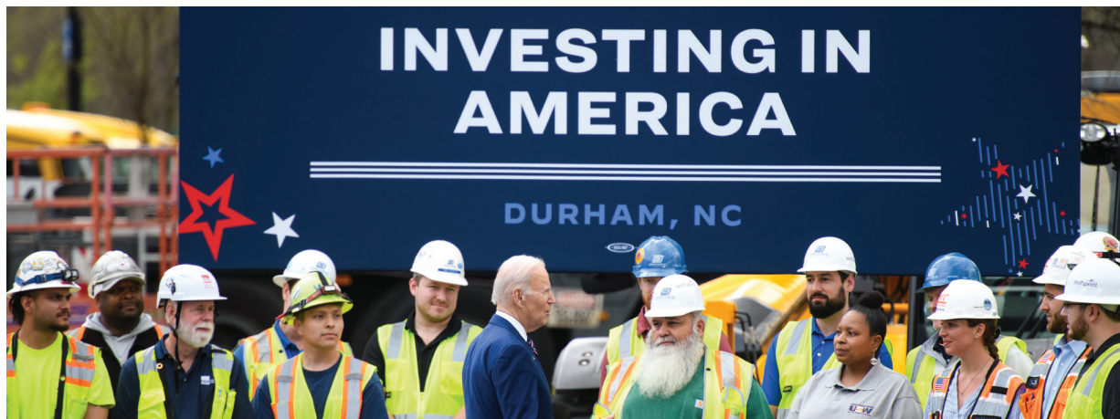
President Biden greets union workers after a visit to Wolfspeed, a semiconductor manufacturer, as he kicks off his Investing in America Tour on March 28, 2023, in Durham, North Carolina.