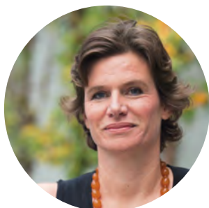
Italy Professor Mariana Mazzucato

Executive Director of the Aspen Institute in Berlin, Adjunct Lecturer Hertie School, and former Head of Department for External Economic Policy at the Federation of German Industries